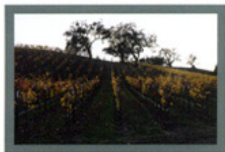
JOHN HALL & ASSOCIATES (JHA)