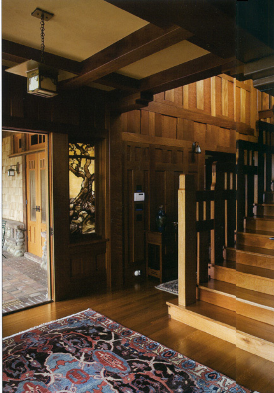
EXCEPT IN THE KITCHEN, WHERE SOMETHING MORE MOISTURE PROOF WAS NEEDED, THE INTERIOR WOOD SURFACES, INCLUDING HERE THE MAHOGANY-PANELED ENTRY HALL AND INTRICATE STAIRWAY, WERE GIVEN A SIMPLE WAX-OVER-STAIN FINISH.