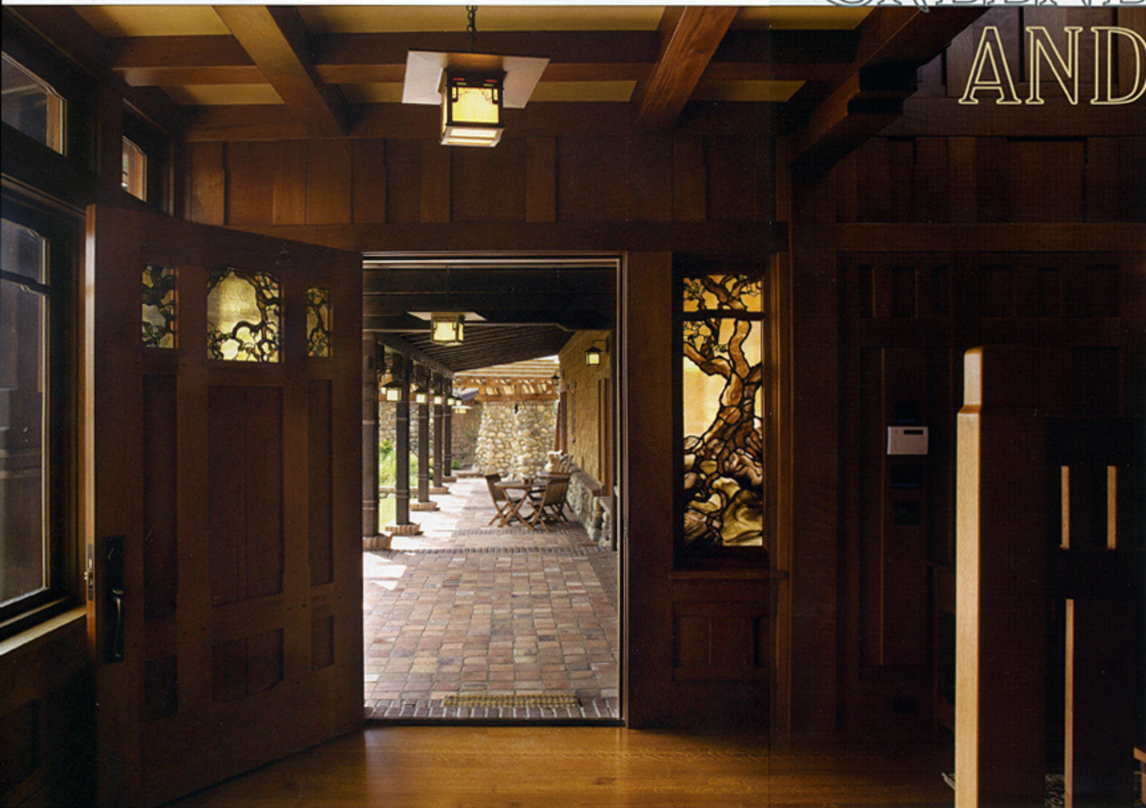
THE FRONT DOOR, EMBELLISHED WITH THEODORE ELLISON'S LEADED GLASS, FRAMES THE DEEPLY SHADED PORCH, WHICH PROVIDES SHELTERED COMFORT EVEN ON 100-DEGREE SUMMER DAYS.