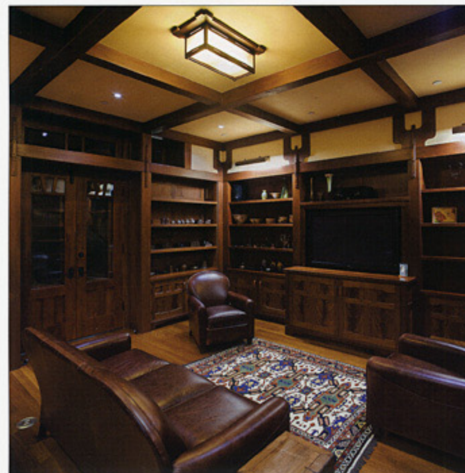
FOR ALL ITS OPENNESS TO ITS SPECTACULAR SURROUNDINGS, THE HOUSE STILL HARBORS QUIET ZONES FOR READING, CONVERSATION AND REFLECTION.